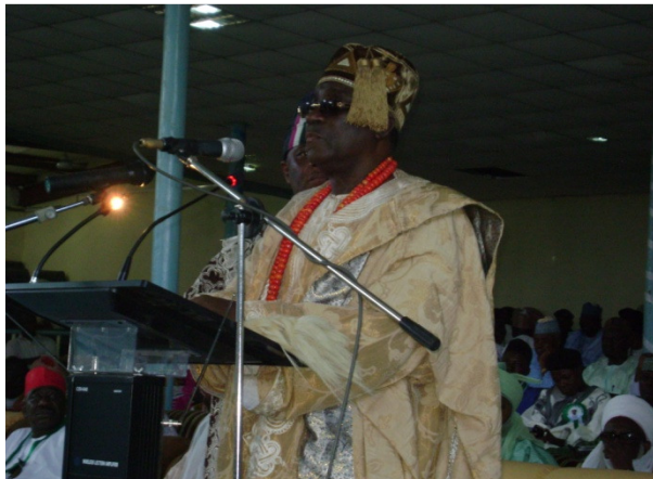
The Chairman of the Occasion, the Oba of Lagos, Rilwan Babatunde

The Chairman of the Public Lecture, His Royal Highness, the Oba of Lagos, Oba Rilwan Babatunde Osulale Akiolu 1, commended Bayero University for honouring the Dan Majen Kano and appreciated the role of traditional institutions in the socio-economic development of the country. The Osiolala Akiolu 1 called on the government to create jobs for the teeming unemployed youth, particularly in the northern states and tasked the CBN Governor to partner with the federal government to create industries in Kano State in order to address the challenges of unemployment and poverty.