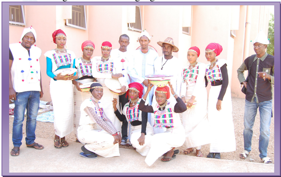
Executive members of the Fulfulde Promotion Club in a group photograph

Fulfulde Promotion Club of Bayero University, Kano held Fulfulde University, Kano to see Day on Saturday, 14<sup>th</sup> November, 2015, which is an occasion meant themselves as being to swear-in the new executives to bring together the Fulani privileged to have reached community in the University and outside, and to listen to lectures on issues bothering the Fulfulde language and the Fulbe.