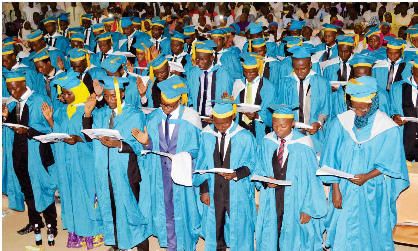
Graduands reciting oath of allegiance