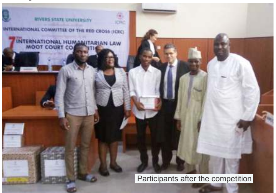
Participants after the competition

The Bayero University, Kano team was led by Malam