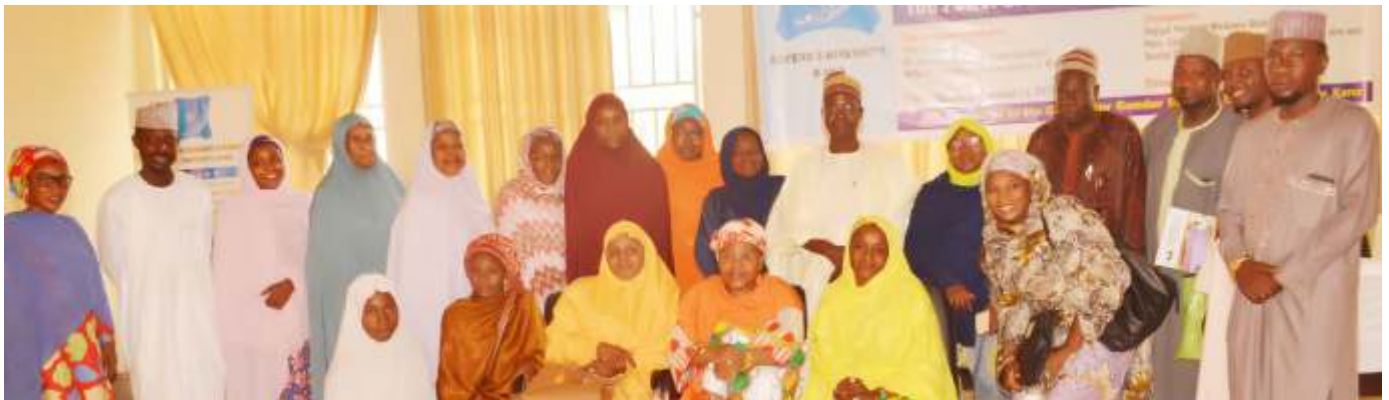
Participants of the Girls Child Symposium in a group photograph

Representatives from NAPTIP, Egyptian Centre for Cultural and Educational Affairs, Embassy of Egypt and Kano State Ministry of Women Affairs were all in attendance.