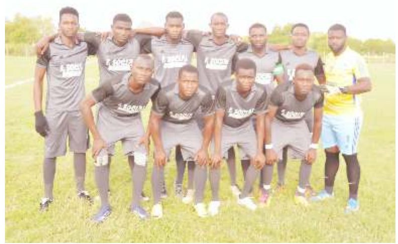
Victorious team of the Faculty of Social Sciences