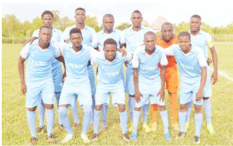
The second best team Faculty of Computer Sciences and Information Technology