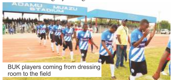
BUK players coming from dressing room to the field