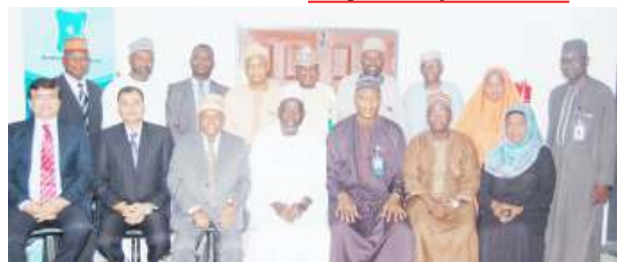
VC with other Principal Officers in a group photograph with members of the Management of Skyline University during a courtesy call by the later