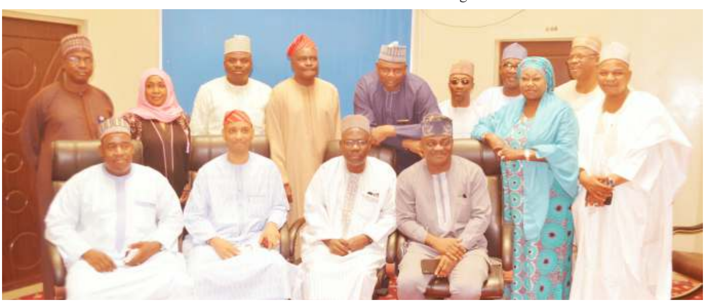
Members of BUK Management in a group photograph with the visiting members of the House of Representatives Committee on Public Procurement

He appreciated its proposal to establish the new centre, explaining that, in view of its importance, the University Management had upgraded the Procurement Unit to a full-fledged directorate with a director heading it.