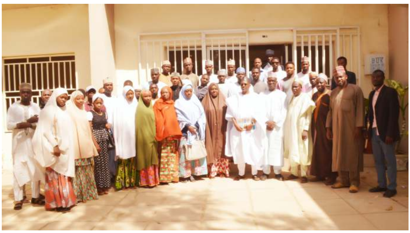
Beneficiaries of the scholarship and staff of the University, shortly after issuance of the cheques