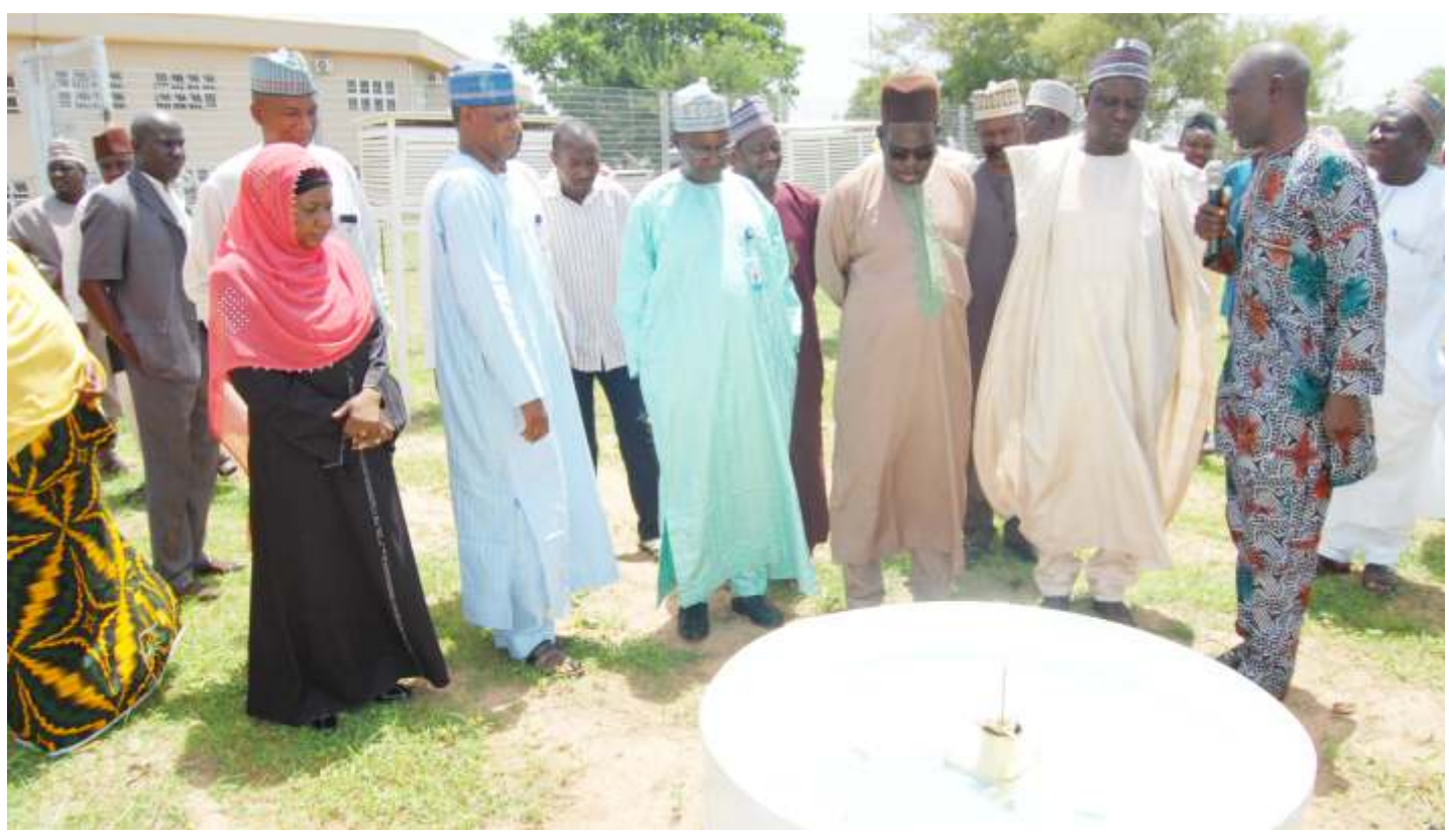
Members of BUK management and NIMET at scene of commissioning weather station