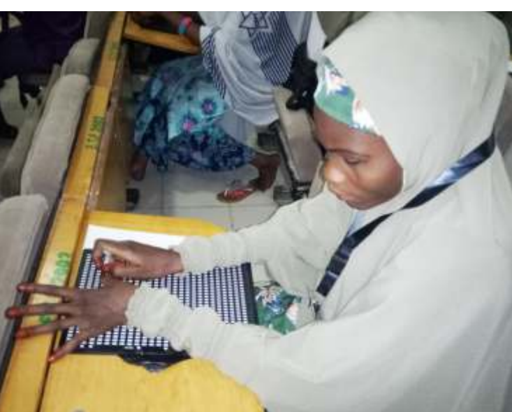
Some visually impaired candidates writing their UTME at Kano centre