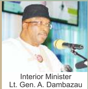
Interior Minister Lt. Gen. A. Dambazau