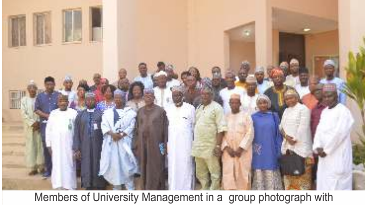
NUC Accreditation team

An Accreditation Panel from the National Universities Commission has arrived at Bayero University, Kano for an accreditation exercise. The panel paid a courtesy visit to the Vice Chancellor on Monday, 22<sup>nd</sup> October,