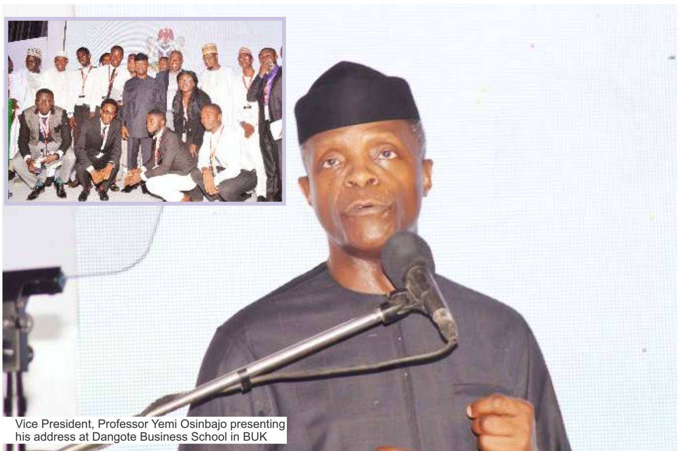
Vice President, Professor Yemi Osinbajo presenting his address at Dangote Business School in BUK

creativity, where students from across Universities and Polytechnics in Nigeria pitch their innovative ideas, learn the skills required to start and grow a successful business; perfect pitch delivery, receive business developmental support and join a network of entrepreneurs and innovators.