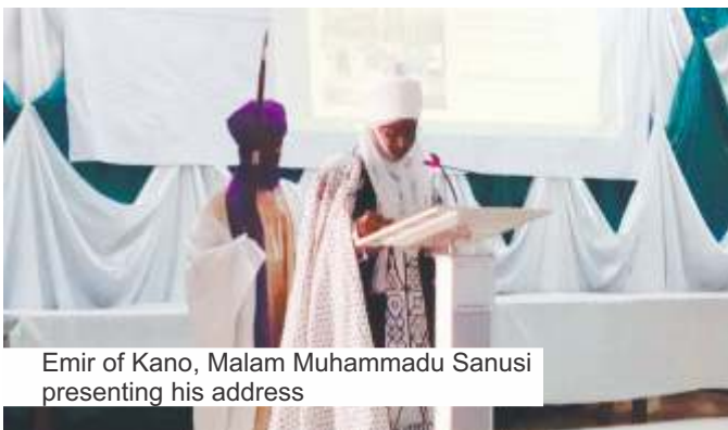
Emir of Kano, Malam Muhammadu Sanusi II presenting his address

The Emir pointed out that Northern Nigeria had an atmosphere conducive for teaching and learning even before the advent of British imperialism. After the coming of the Europeans, however, teaching and learning atmosphere of the region changed and up to now, nothing tangible has been achieved, making one wonder if we had