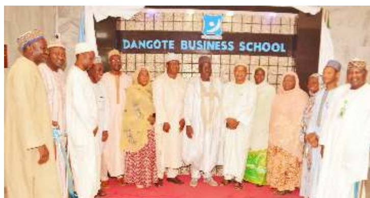
VC, members of the University Management, Dean, and staff of DBS posing before the new emblem of DBS