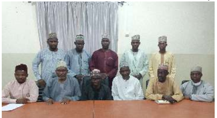
The new executives of Muslim Forum BUK shortly after their inauguration

He said, “We came in as exco towards the end of 2015, so we have four years and a few months and we agreed that a new exco should come into effect on 28 th January,