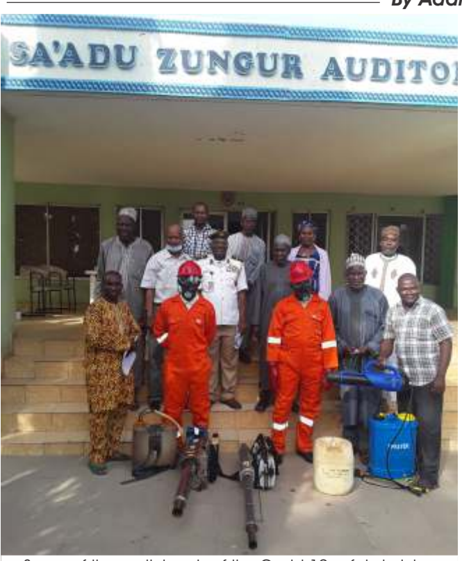
Some of the participants of the Covid-19 safety training

The Mambayya House, Centre for Democratic Studies has conducted tripartite training on safety, operations and maintenance to members of its staff as part of measures to contain the spread of Corona Virus (COVID-19) pandemic.