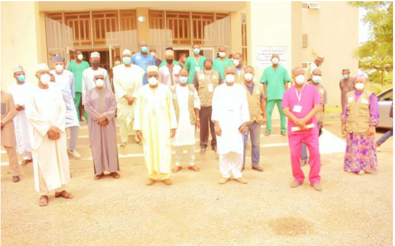
A group photograph of BUK Management, Provost, CHS, NPS, Directors, NCDC officials and staff CIDR after commissioning of BUK Test Centre of Covid-19

before the testing is carried out. He said the Kano Task Force Team and NCDC are the ones concerned as BUK only established the centre to complement their efforts in the fight against the covid-19.