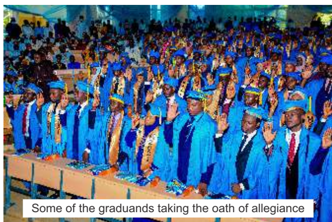
Some of the graduands taking the oath of allegiance

The medical elder equally advised the new doctors to ask questions to their teaches, especially HODs during their