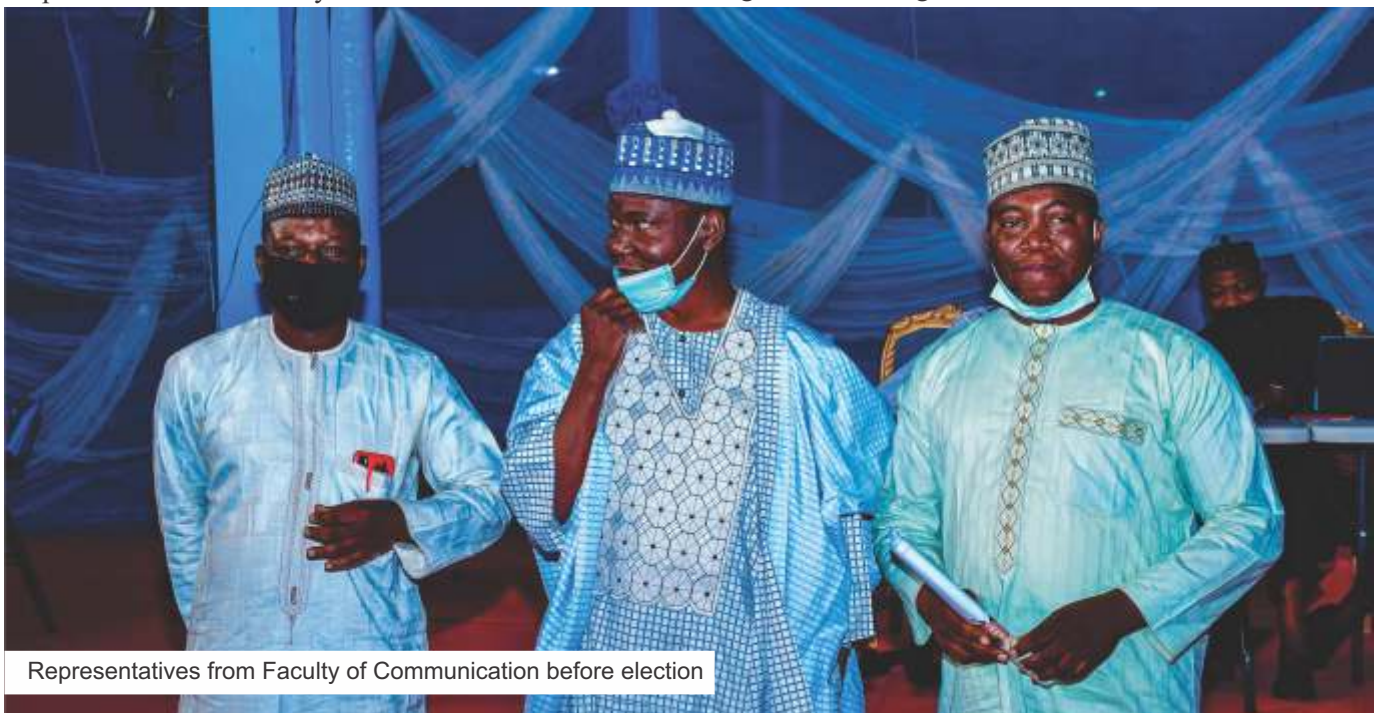
Representatives from Faculty of Communication before election

He urged the Congregation to observe decorum and respect the guideline during the elections.