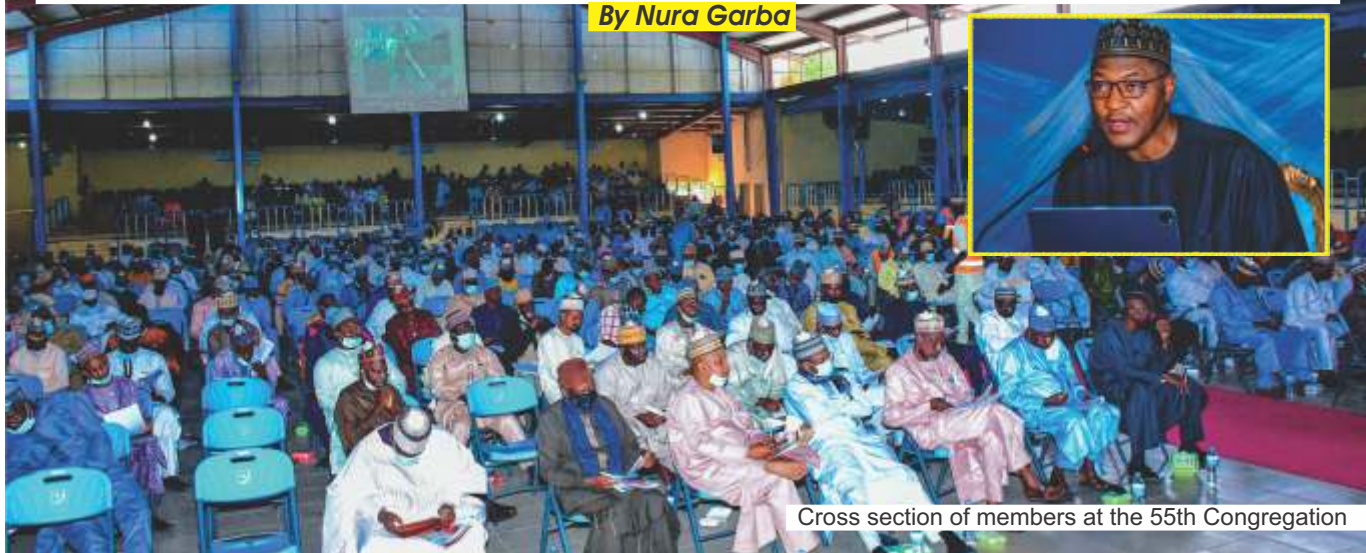
Cross section of members at the 55th Congregation