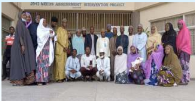
Students on SIWES from SCE, BUK

During the second quarter, students from School of Continuing Education, Bayero University, Kano completed their Industrial Training with the University Library. The University Librarian commended the participants for their hard work, punctuality and discipline.