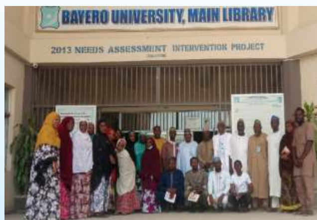
Students on SIWES Program from SCE, BUK

The University Library received SIWES students from the School of Continuing Education, Bayero University, Kano on 6 th May 2021. As a tradition, the students alongside other existing SIWES students from within and outside the University will receive rigorous and outstanding training and field experience from the Library.