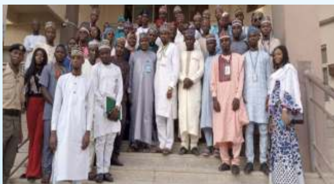
Political Science Students from Federal University, Dutsin Ma, Katsina State

Similarly, the University Library received some students of Political Science from the Federal of University, Dutsin Ma, Katsina State. The purpose of the visit was to learn from the University Library, good practices of information retrieval and service delivery. The University Librarian honored their visit and assured them of support of the Library, particularly on Information Literacy.