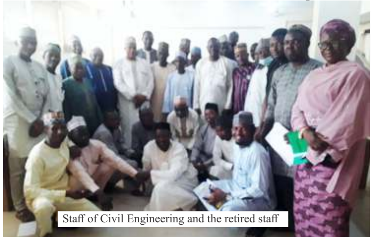
Staff of Civil Engineering and the retired staff