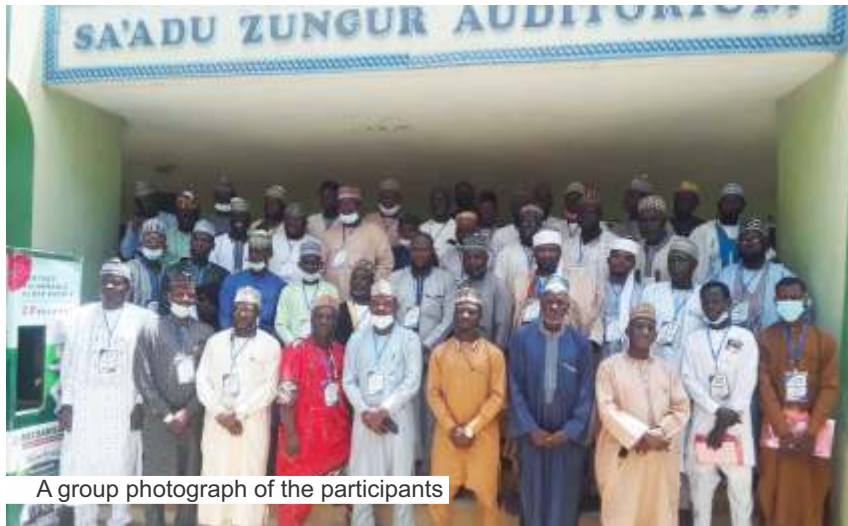
A group photograph of the participants