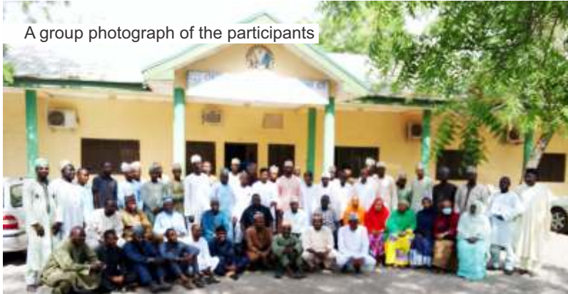
A group photograph of the participants

The Nigerian Communications Commission (NCC) through its training arm, Digital Bridge Institute has trained one hundred and ten BUK staff including teaching and non-teaching staff on Advanced Digital Appreciation Programme (ADAPTI) 2021.