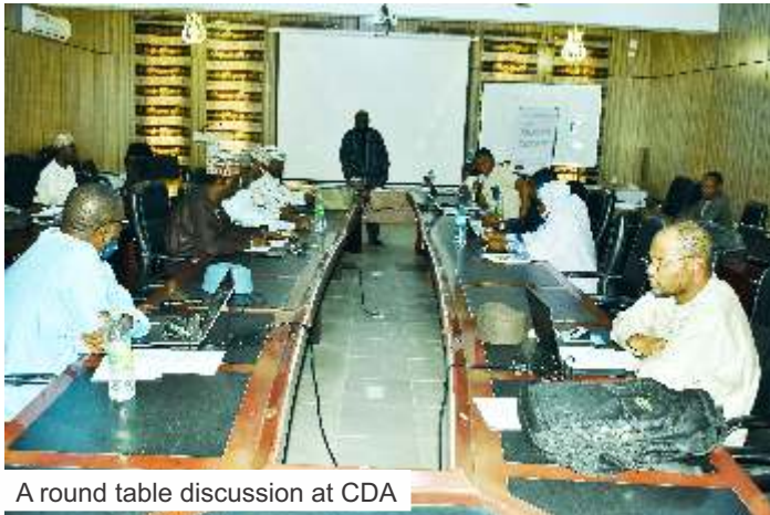
A round table discussion at CDA

As part of the process, the Centre on Monday, 12 th April, 2021 organized a round-table discussion where stakeholders from industries, academia and research