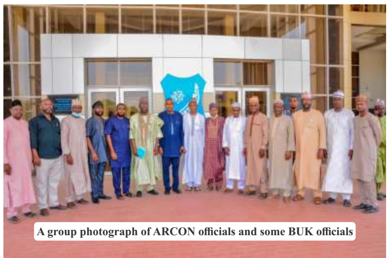
A group photograph of ARCON officials and some BUK officials

He said he was confident that the University would address the observations raised and he would recommend to VC to sponsor staff of Architecture to the ARCON's annual Colloquium.