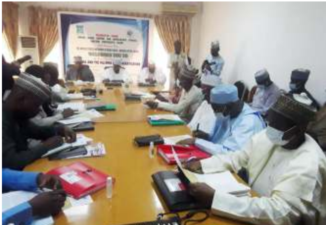
Participants in a group photograph during a workshop

Professor Jega argued that, although there is a lot of political brinkmanship by politicians and some extremist groups on the quest for restructuring, but we need to put that brinkmanship aside and look at the substantive issues in which restructuring can help the country develop socio-