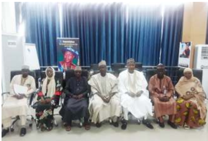
Officials from NITDA in a group photograph with VC and Management staff

He said, they were at the University to interact with the management as well as students who benefited from the NITDA scholarship in order to assess the progress in their studies and the challenges they are facing.