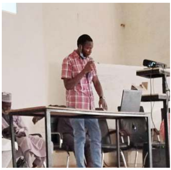
President Developers Students Club, BUK