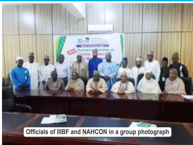
Officials of IIIBF and NAHCON in a group photograph