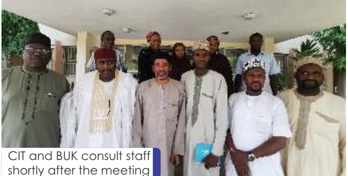
Vol. XL No. 31 Bulletin Friday, 11 June, 2021