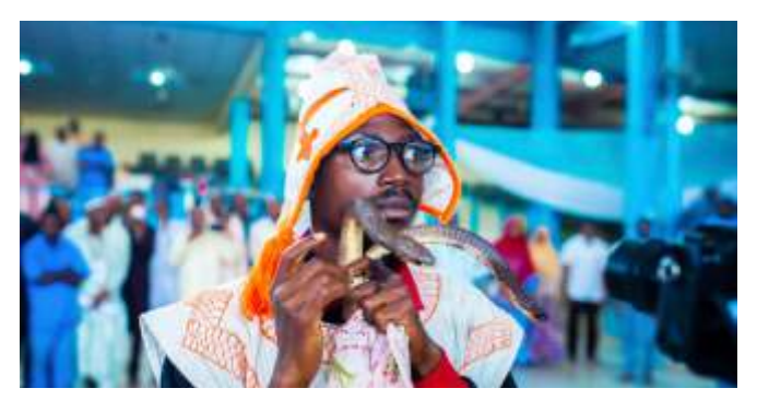
A man entertaining participants with a cultural and traditional display

Vol. XL No. 35 Bulletin Friday, 25 June, 2021