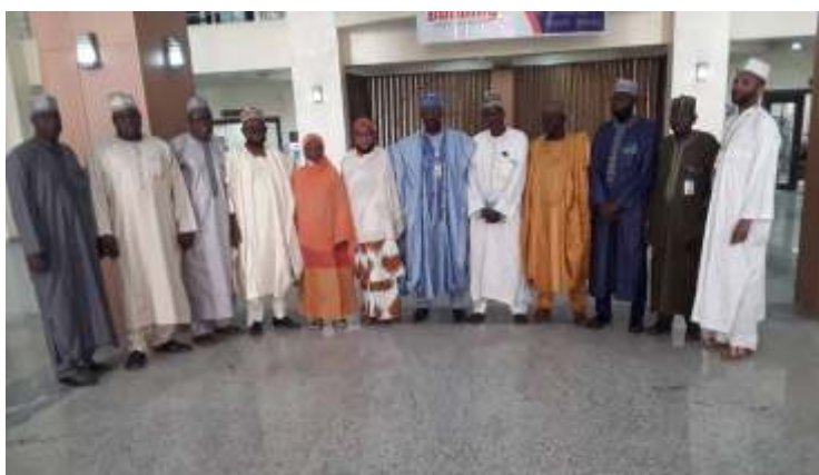
A group photograph of CSN officials and DVC (Academics and Management Services)