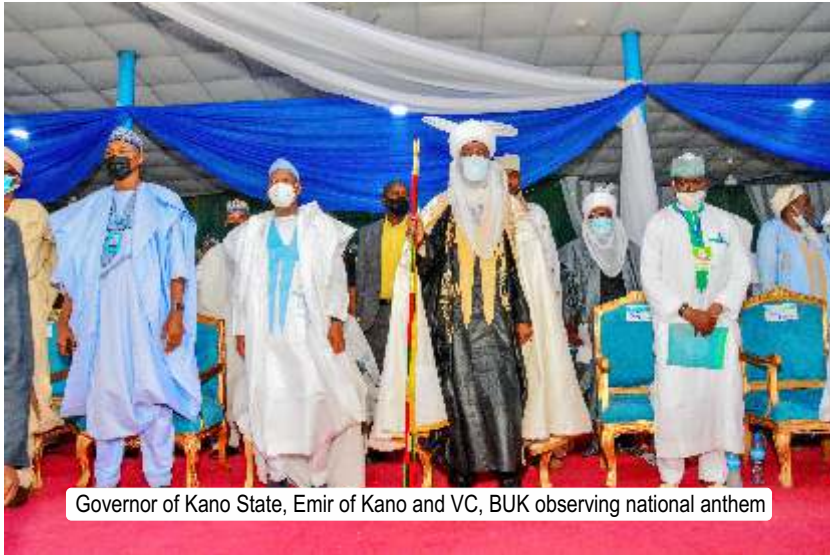
Governor of Kano State, Emir of Kano and VC, BUK observing national anthem