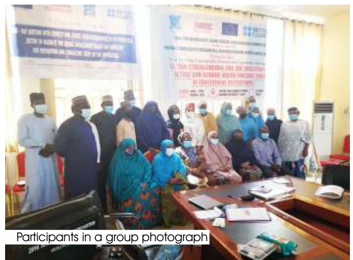
Participants in a group photograph