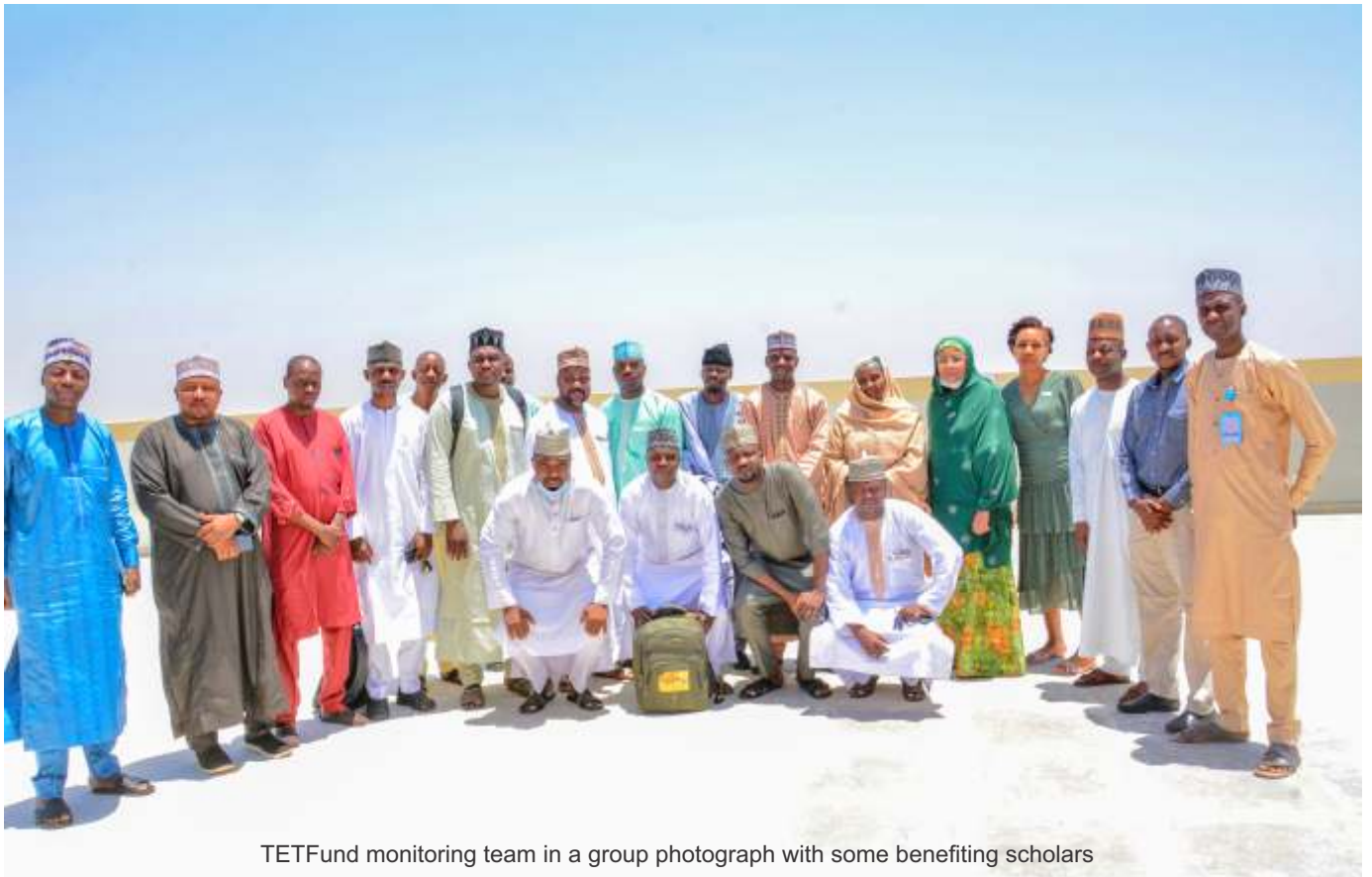
TETFund monitoring team in a group photograph with some benefiting scholars