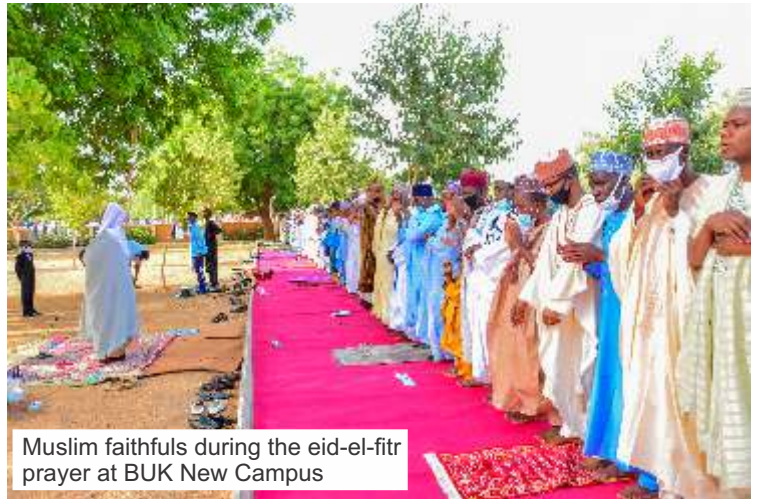
Muslim faithfuls during the eid-el-fitr prayer at BUK New Campus