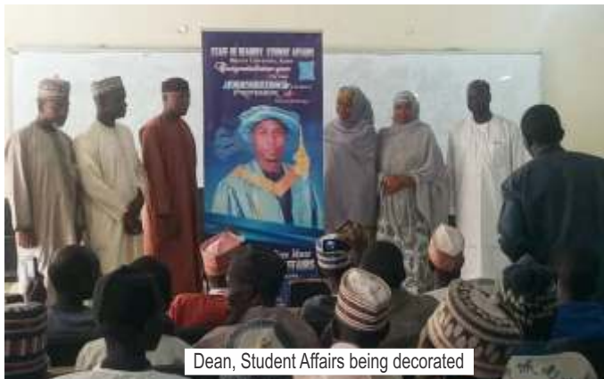
Dean, Student Affairs being decorated