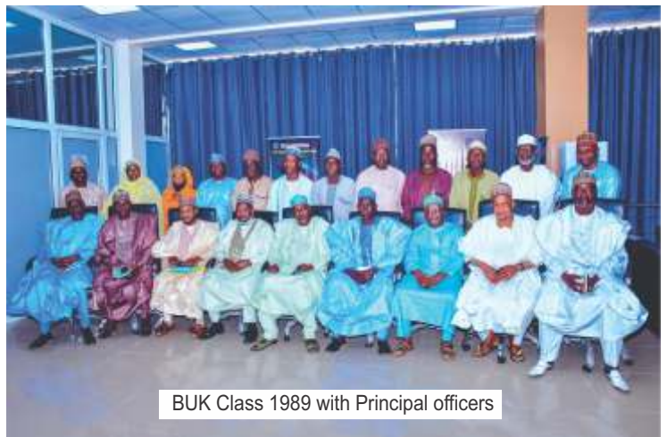
BUK Class 1989 with Principal officers