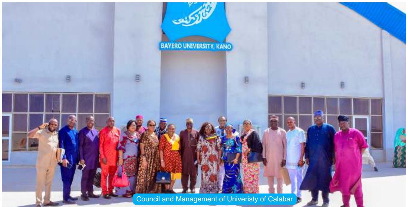
Council and Management of Univeristy of Calabar

Equally, the Vice Chancellor and some other Principal Officers were accommodated by the Bayero University.