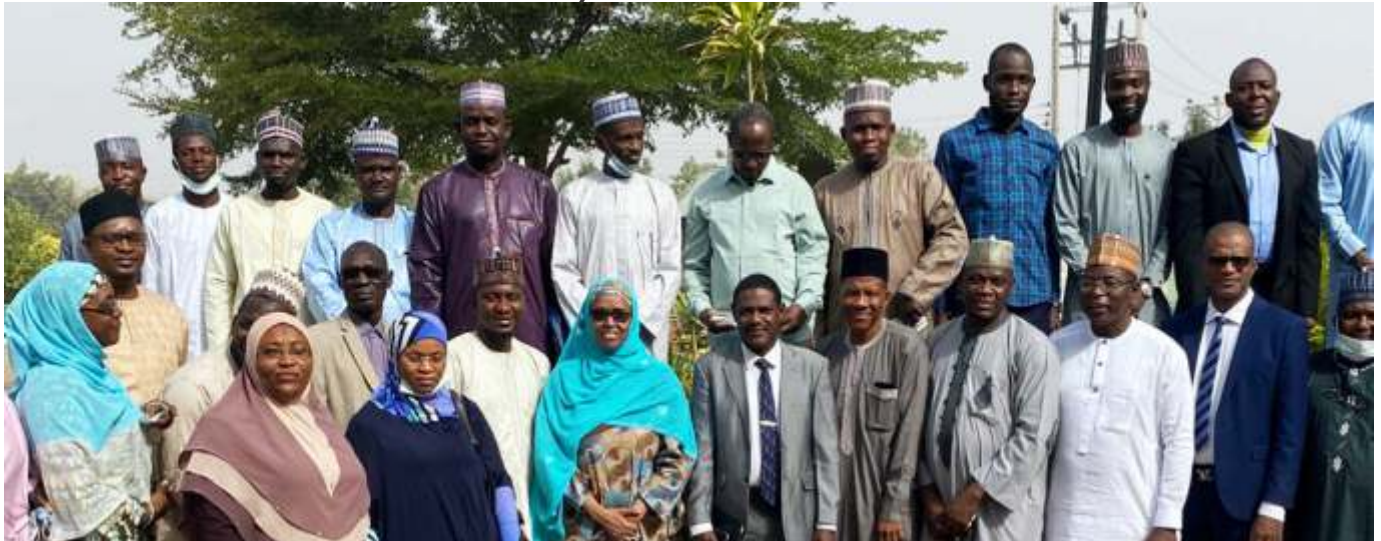
ACEPHAP Team in a group photograph

ACEPHAP Management Team and its Collaborating Faculties from Bayero University converged on the popular Porto Golf Resort; Minjibir in Kano State for its first ACEPHAP Retreat aimed at assessing the progress the Centre has made so far as well as prepare for the new academic session.