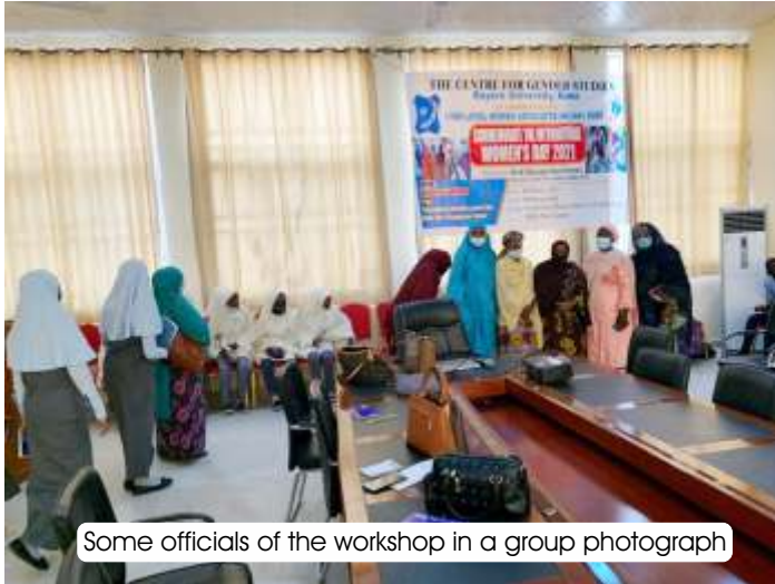
Some officials of the workshop in a group photograph