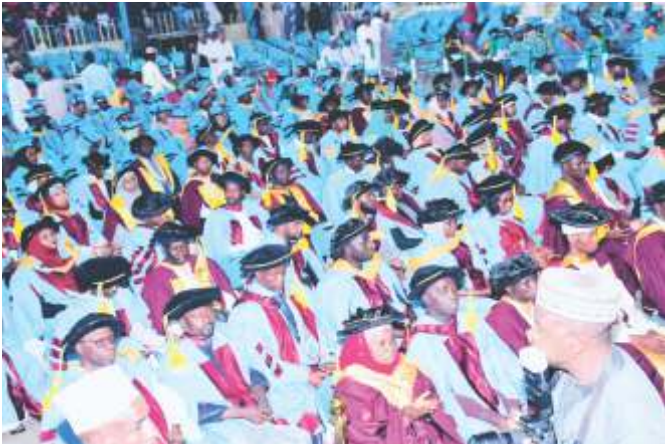
Vol. XLII No. 45 Special Bulletin Friday, 18th August, 2023