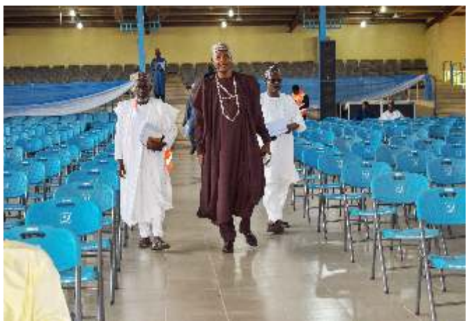
Vol. XLII No. 45 Special Bulletin Friday, 18th August, 2023