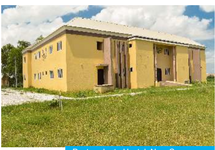
Postgraduate Hostel, New Campus