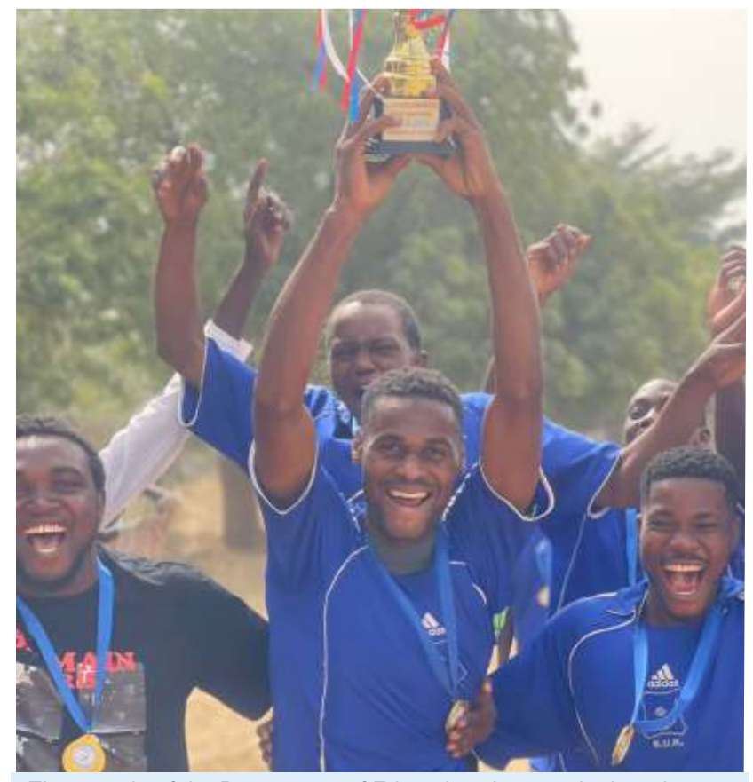
The captain of the Department of Education, Anas and other players celebrating the trophy they won