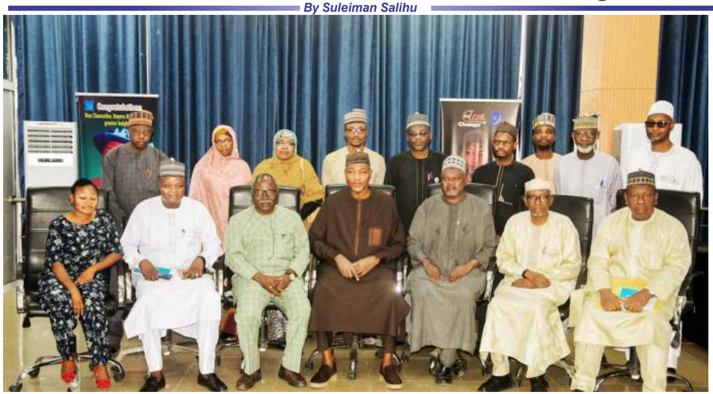
Members of the NUC Accreditation Team in a group photograph with BUK Management

National Universities Commission (NUC) accreditation teams visited Bayero University, Kano (BUK) for accreditation exercise. The visit took place on Monday, 18<sup>m</sup> November, 2024.