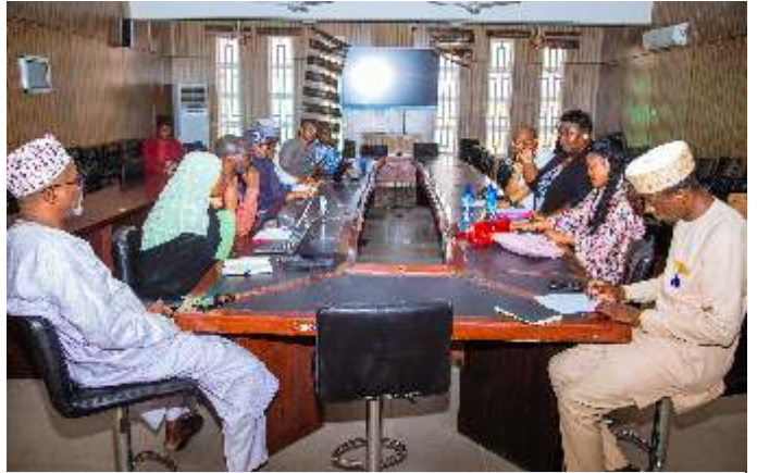
Officials from CDA and WACOT Ltd in a meeting session

research on sesame seed improvement for increased yield.