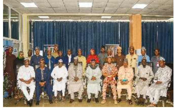
Team of Accreditation in a group photograph with the Principal officers

He assured that the team was not a punitive one, but on a mission to make observations and notify the authority on areas of deficiencies for the Management to take measures.