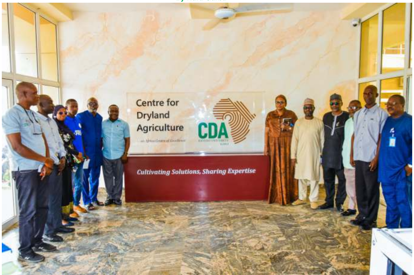
CDA and Kwara L-PRES Team in a group photograph

On Thursday, August 1, 2024, a delegation from the Kwara State Livestock Productivity and Resilience Support (L-PRES) Project visited the Centre for Dryland Agriculture (CDA) to explore collaborative opportunities.