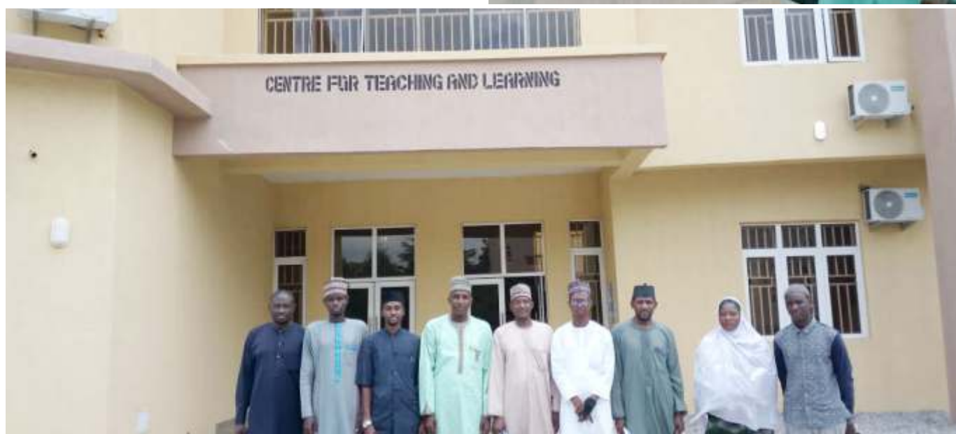
A group photograph of Centre for Teaching and Learning Team and Director DRIP