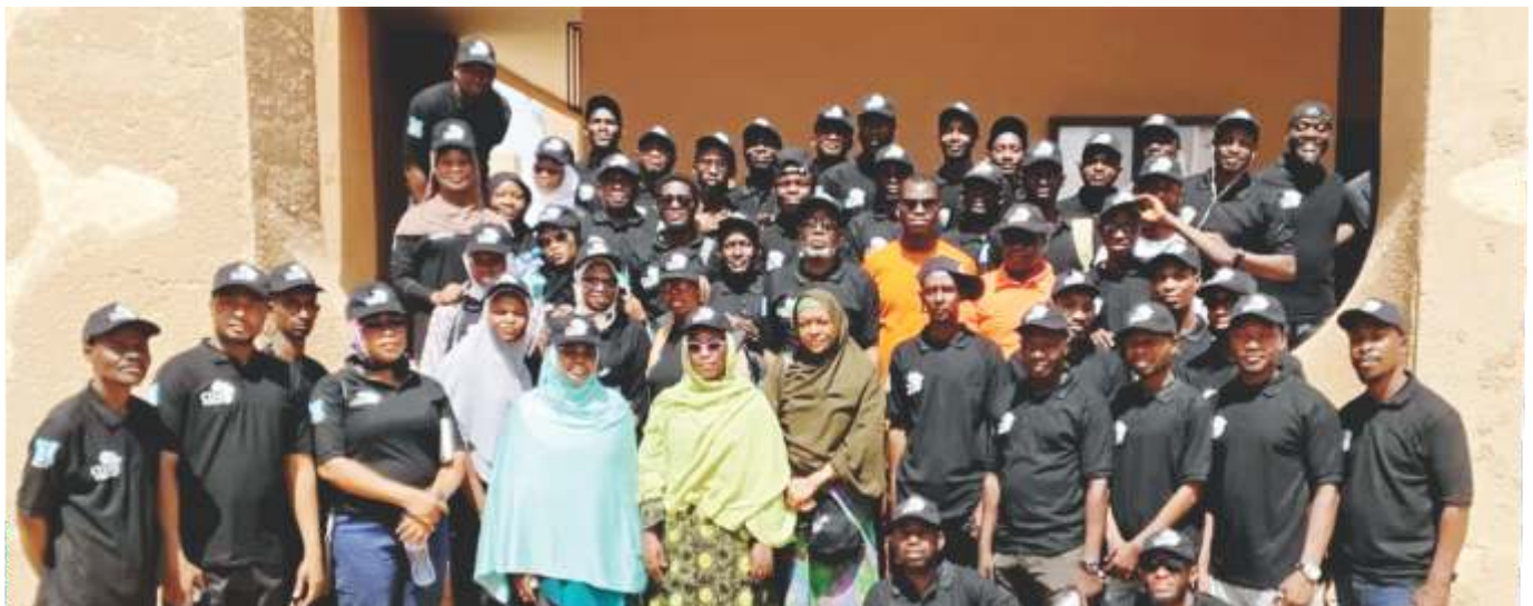
CDA delegation on strategic field mission to Niger Republic in a group photograph

A 12-member delegation from Bayero University, Kano (BUK), through the Centre for Dryland Agriculture (CDA), recently embarked on a strategic field mission to Agadez, Niger Republic, to deepen academic ties and foster cross-border knowledge exchange in dryland agriculture.