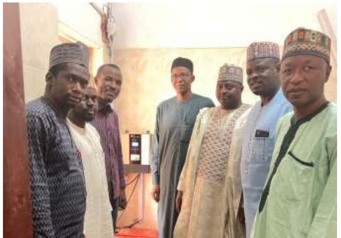
Staff of Faculty of Computing in a group photograph with VC's representative

The project cost about six million Naira (N6m) and would improve research output and strengthen efficiency of staff and students.