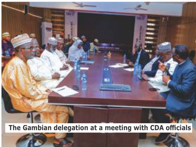
The Gambian delegation at a meeting with CDA officials

The Gambian government has reaffirmed its commitment to expanding the number of students pursuing postgraduate programmes in Bayero University, Kano, citing the University's high standards in teaching, learning, and research.