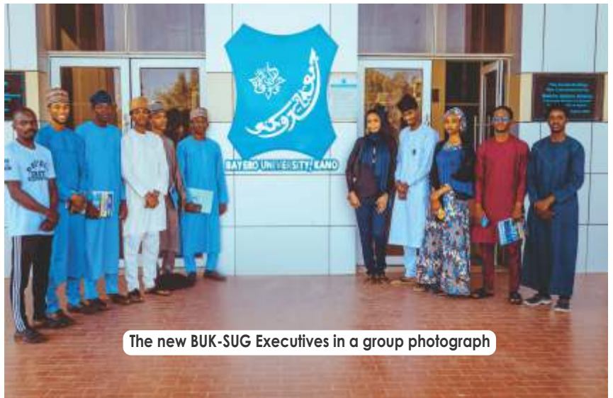
The new BUK-SUG Executives in a group photograph