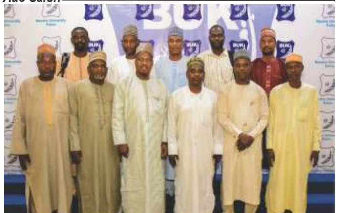
Danbatta community delegation in a group photograph with DVC (Academic)