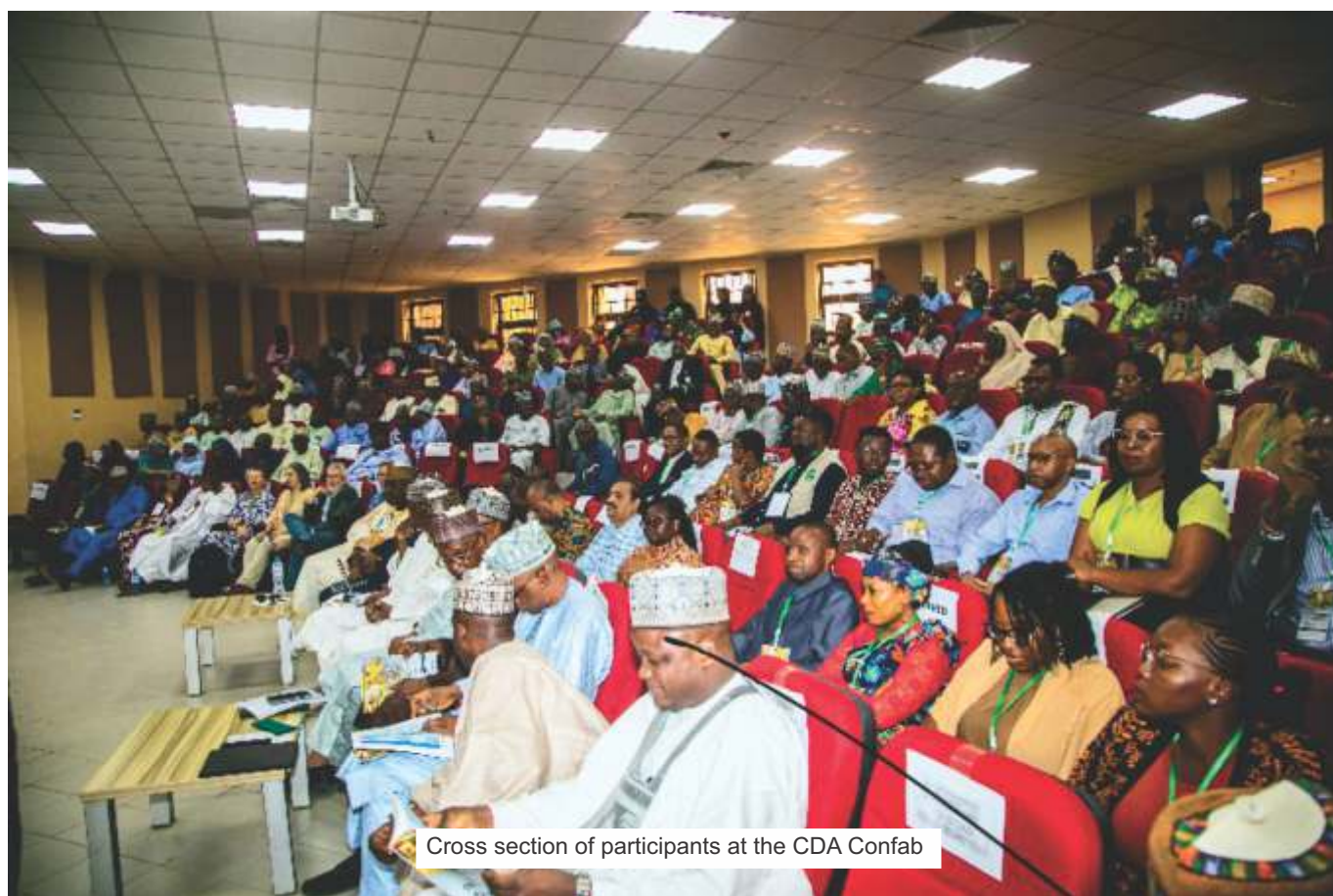
Cross section of participants at the CDA Confab