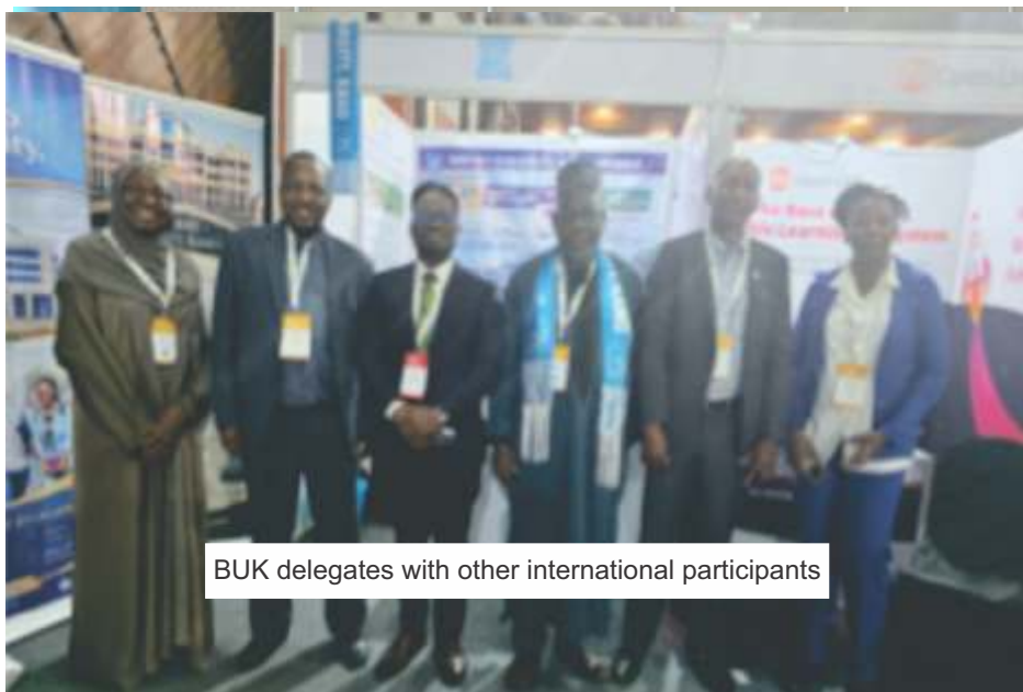
BUK delegates with other international participants