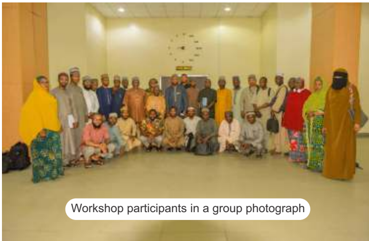
Workshop participants in a group photograph

He explained that digital education today is not sufficient only to get the job done but what matters, now was on how the job meet the need and expectation of the time. He noted that educational industry is a highly demanding field in