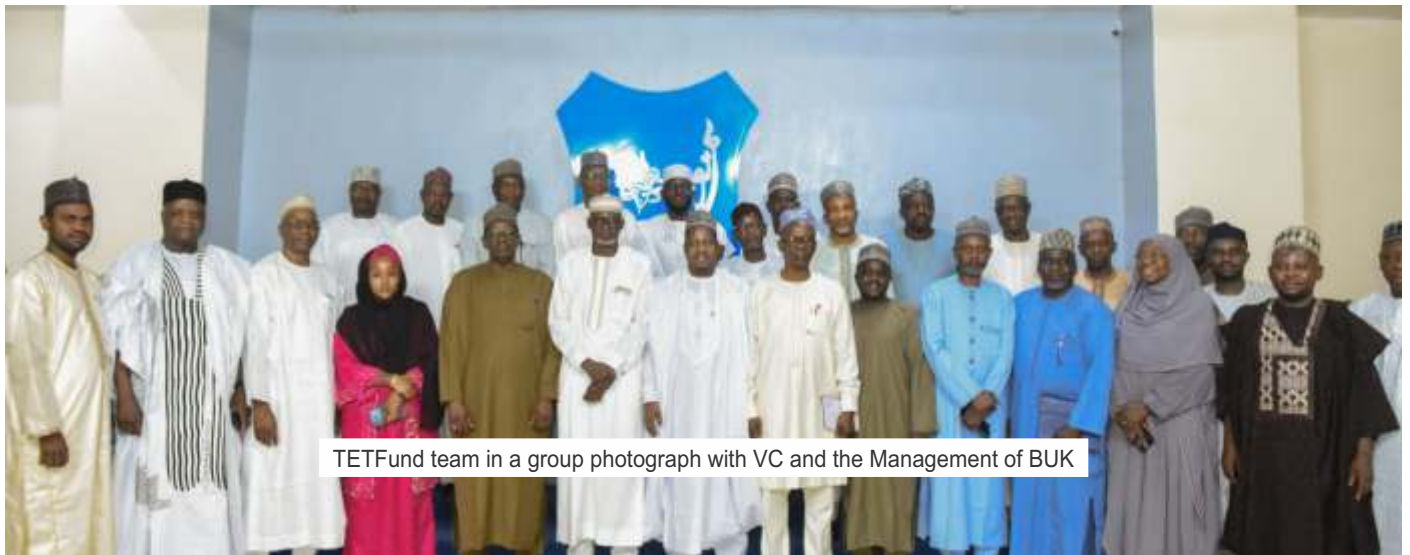
TETFund team in a group photograph with VC and the Management of BUK